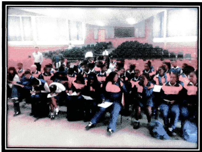
SHS Learners sign up at pre-selection

The event was very successful and more than 70 learners submitted applications. These were then screened and a group of 62 learners attended the inaugural session on 9 October 2013.