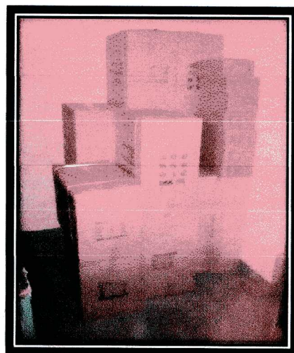
Some of the instruments on delivery at SHS

Costs and other details are presented in Annexure A.