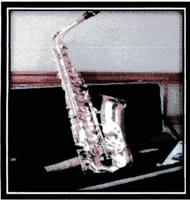
One of the Alto Saxophones delivered to SHS

Understanding. In return the school has agreed to keep an up-to-date inventory recording the use and condition of each instrument. They also accept full liability of all Musiquelaine SA assets while in their possession and have consequently taken sufficient insurance to the full replacement value. Furthermore, when not in use all of the above equipment is stored in a secure strong-room behind a locked security gate in the school hall.